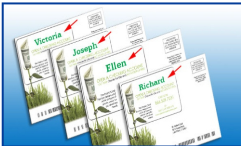
Variable Data Printing