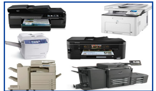
Printer on Lease